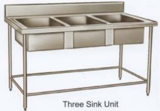
Three Sink Unit