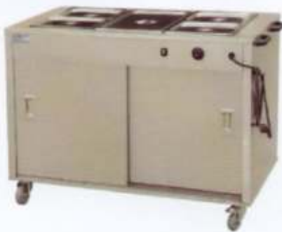
Hot Food Trolley