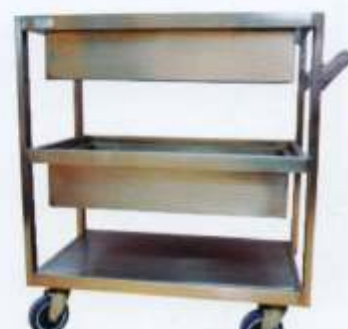
Soil Dish Trolley