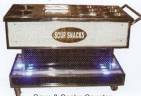
Soup & Snake Counter