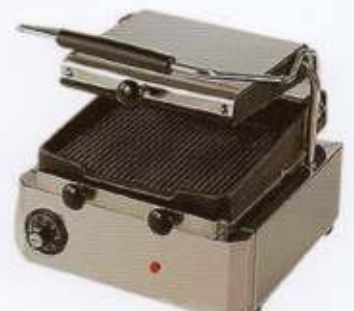
Sandwich Griller (Single)