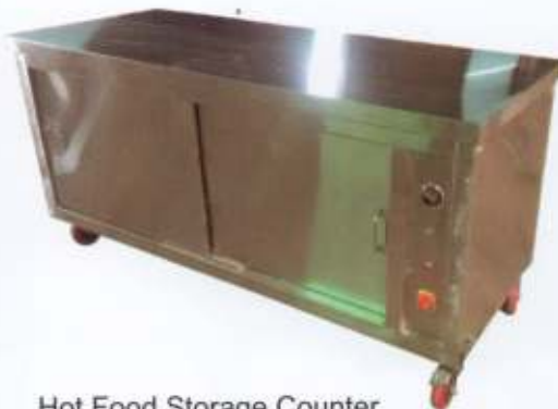
Hot Food Storage Counter