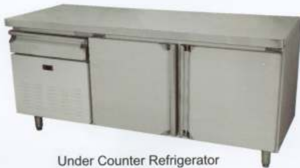
Under Counter Refrigerator