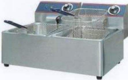
Deep Fat Fryer Double Tank