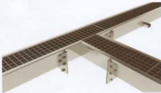
SS Drain Gritting