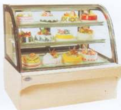
Cake Pastry Display Counter