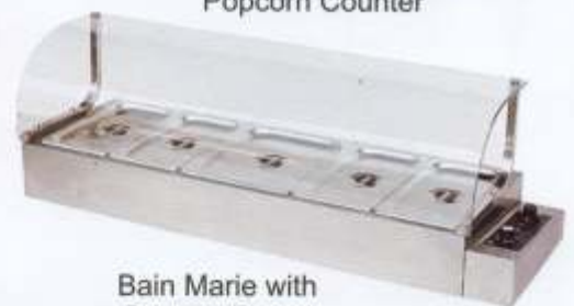
Bain Marie with Sneeze Guard