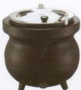
Soup Turine 1