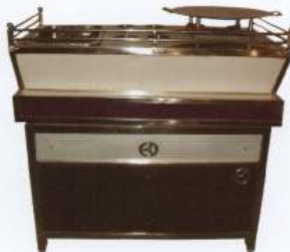
Aloo Tikki Counter