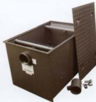
Oil and Grease Trap