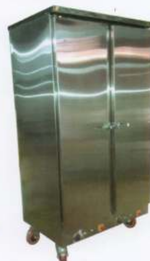
Hot Food Trolley