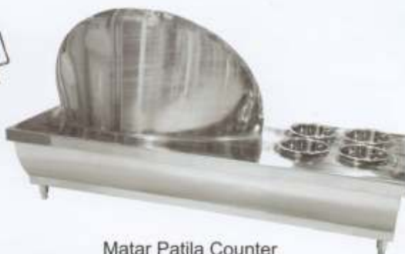
Matar Patila Counter