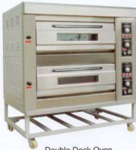
Double Deck Oven