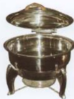
Chaffing Dish 3