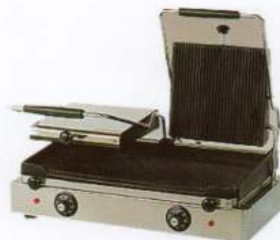
Sandwich Griller (Double)