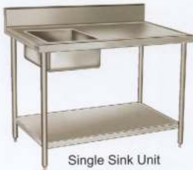
Single Sink Unit