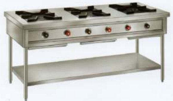
Three Burner Range