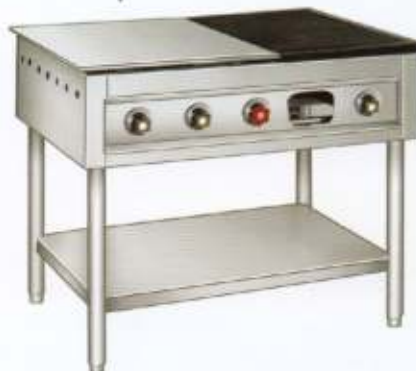
Griddle Plate With Puffer