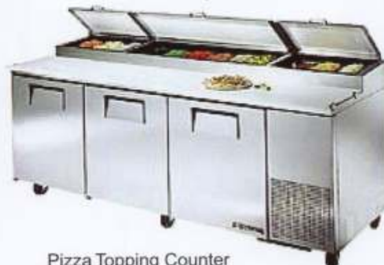
Pizza Topping Counter