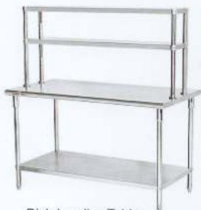
Dish Landing Table