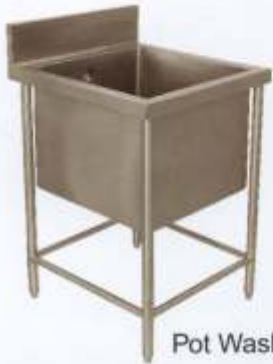
Pot Wash Sink