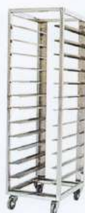
Dish Rack 4