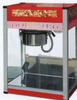
Popcorn Machine 1