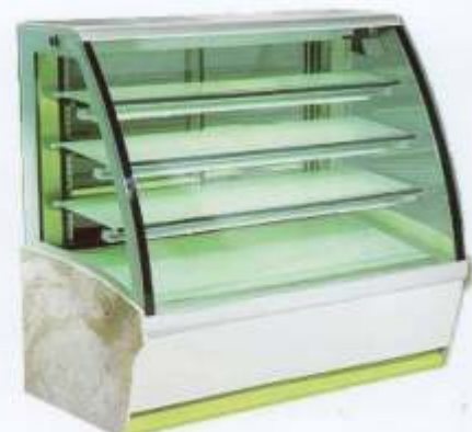
Display Counter 3