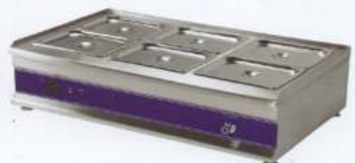
Bain Marie 6 pan