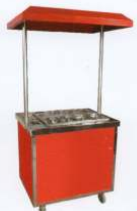
Snack Trolley 4