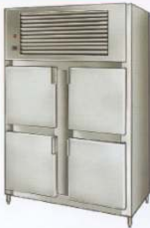
4 Door Refrigerator