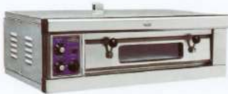
Single Deck Oven