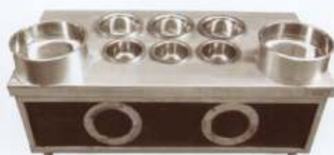
Chat Counter 4