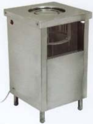
Plate Warmer Single