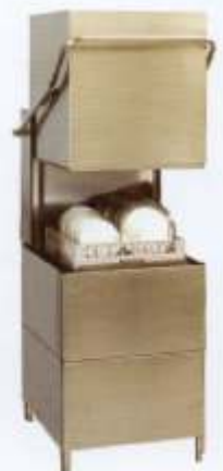
Dish Washing Machine Hood Type