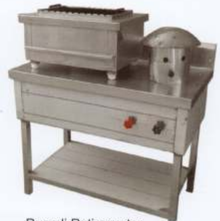
Rumali Roti counter