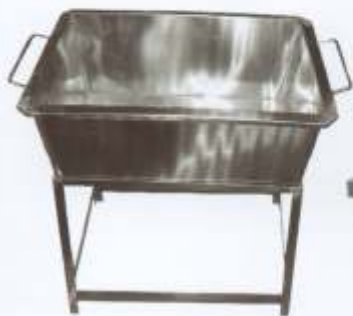
Dish / Dust Bin