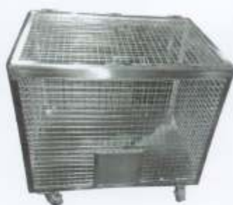
Potato / Onion Bin