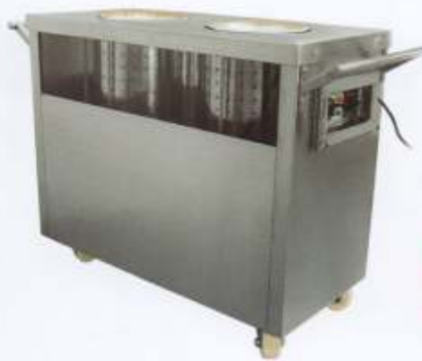
Plate Warmer Double