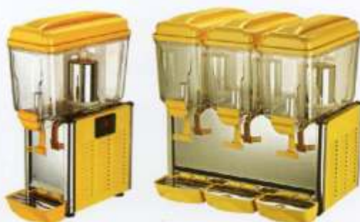
Juice Dispenser Single & Triple