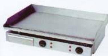
Electric Hot Plate