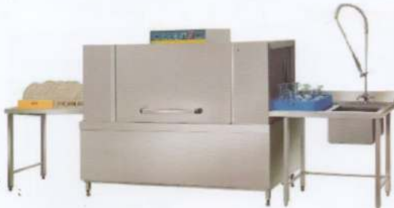
Dish Washing Machine Conveyor