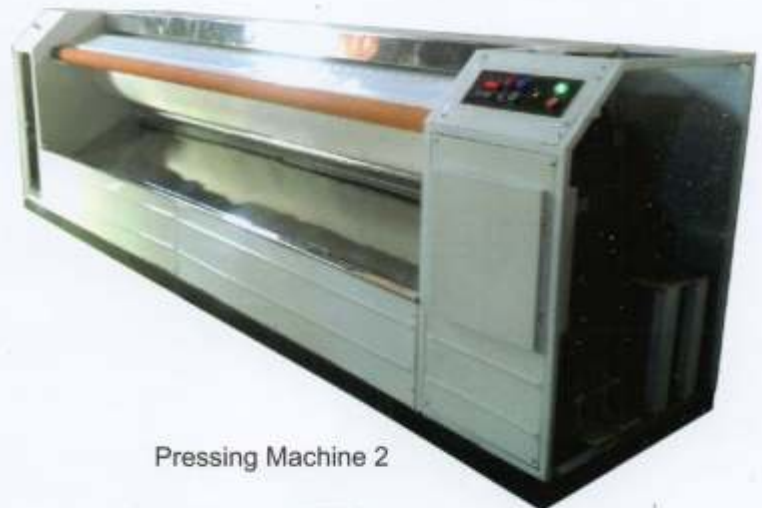
Pressing Machine 2