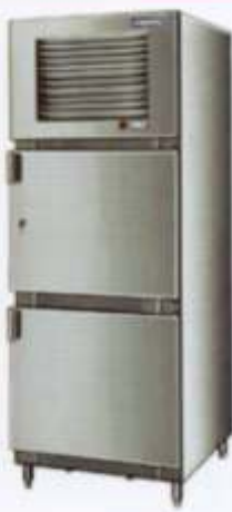
2 Door Refrigerator