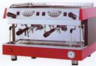
Coffee Machine (Imported)