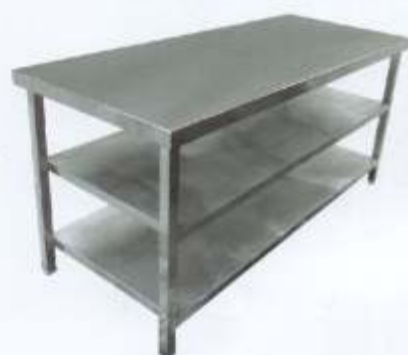
Work Table with Under Shelves