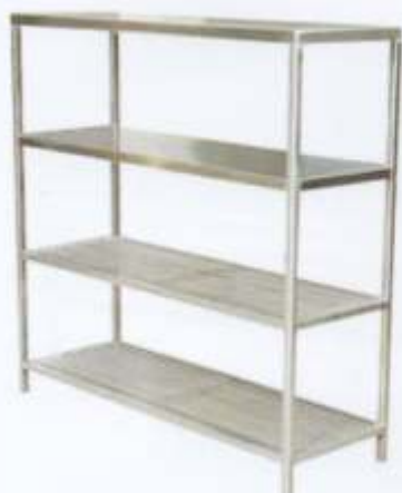
Dish Rack 1