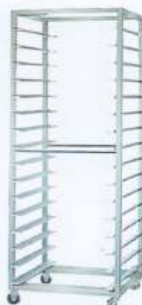
Dish Rack 3