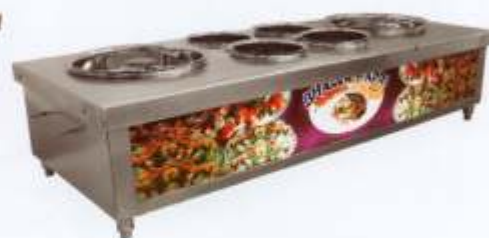
Bhalla Papri Counter