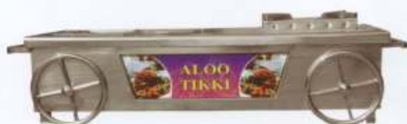
Aloo Tikki Counter