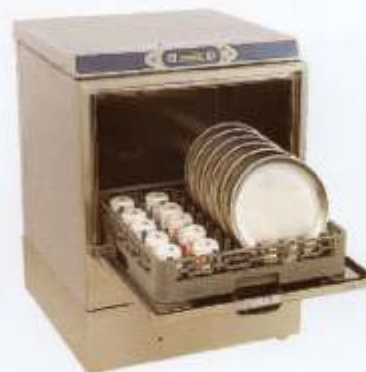
Dish Washing Machine Under Counter