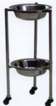
Kick Bowl Trolley