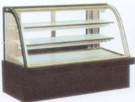
Display Counter 1