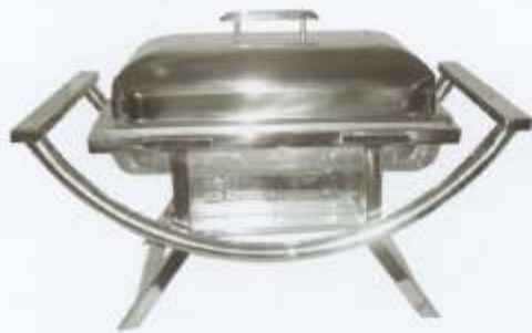
Chaffing Dish 1