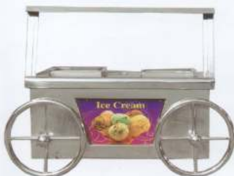
Ice Cream Counter