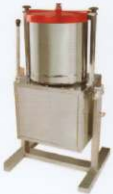
Wet Grinder Tilting Type