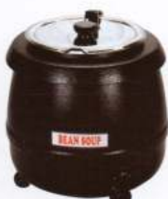
Soup Turine 2