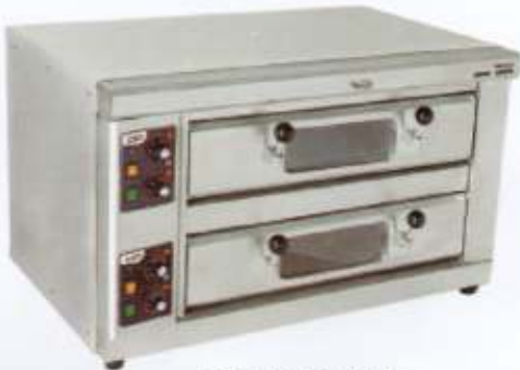
Two Deck Oven