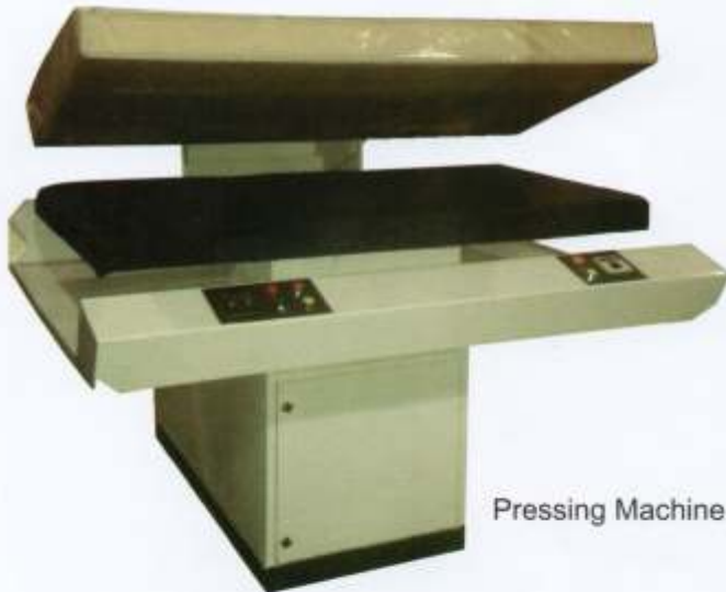
Pressing Machine 1