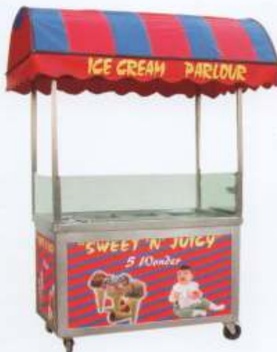
Ice Cream Counter