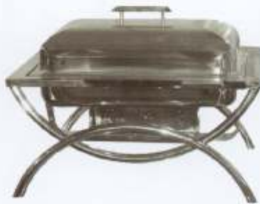
Chaffing Dish 2