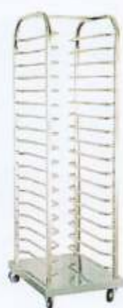
Dish Rack 5