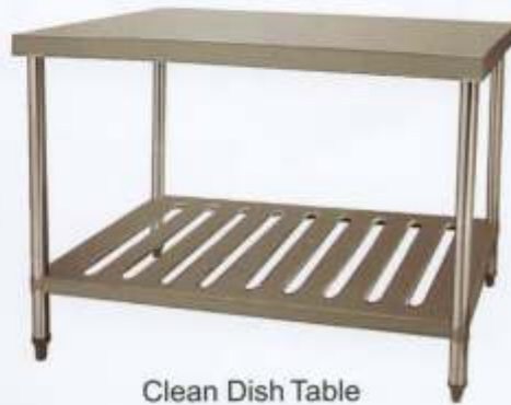
Clean Dish Table