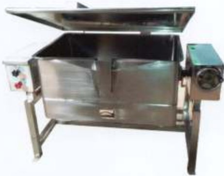
Tilting Breasing Pan