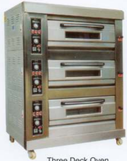
Three Deck Oven