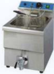
Deep Fat Fryer