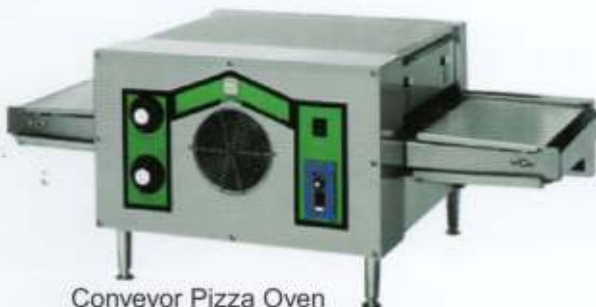
Conveyor Pizza Oven