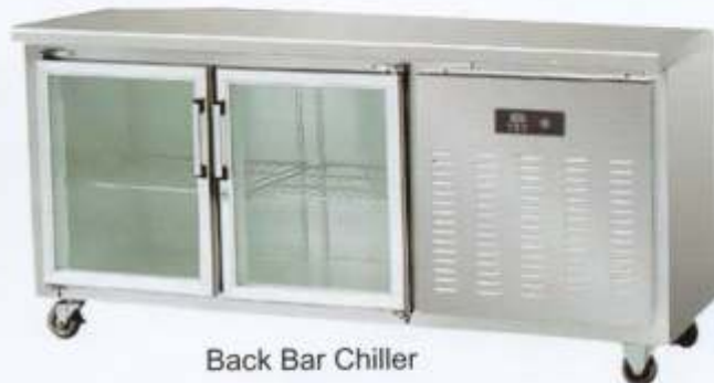
Back Bar Chiller