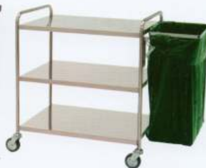
Soil Lenin Trolley