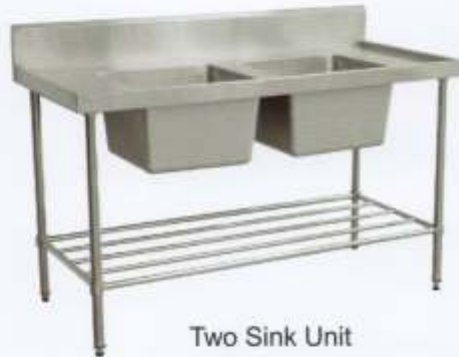
Two Sink Unit