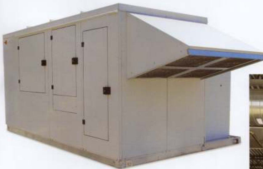
Fresh Air System