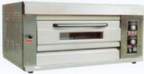
Single Deck Oven