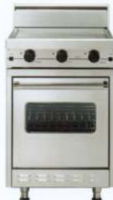
Griddle Plate With Oven