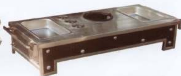
Chat Counter 5