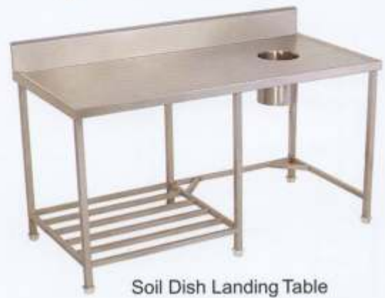
Soil Dish Landing Table