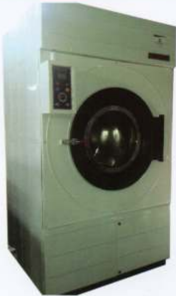
Laundry Machine 1