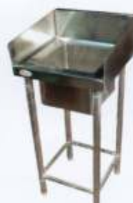
Hand Washing Sink