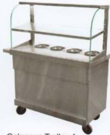
Golgappe Trolley 1