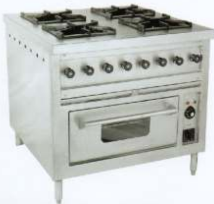
Four Burner with Oven