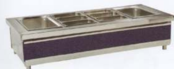
Chat Counter 1