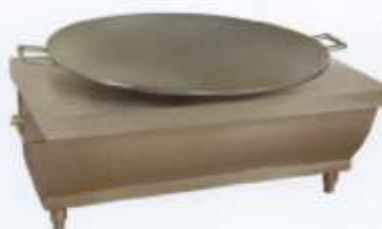
Tikki Counter 2