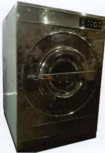
Laundry Machine 2