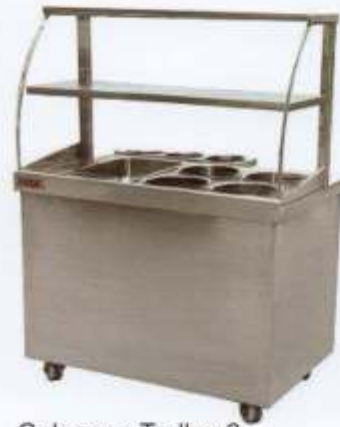
Golgappe Trolley 2