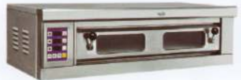
Single Deck Oven Wide